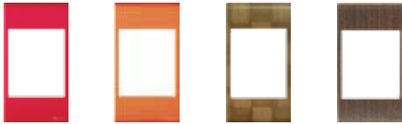
Suitable for 6A Socket Size Item