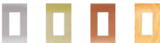
Suitable for 32A D.P. Switch Size Item