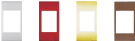
Suitable for 16A Switch & Socket Size Item