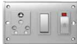
453062 / 453063