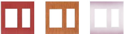
Suitable for 3X1 Combined Size Item