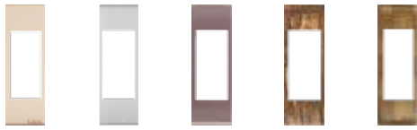
Suitable for 6A Switch Size Item