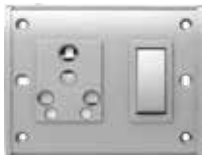
453060 / 453061